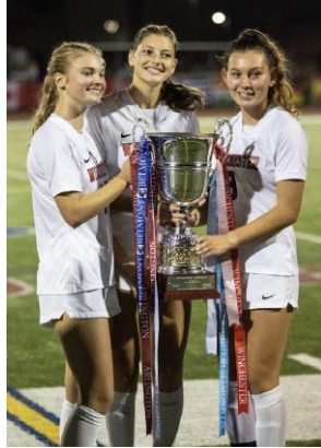
Girls soccer 7-0 win vs. Belmont on 10/2