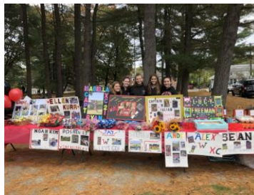
Celebrating last meet for Seniors with love!