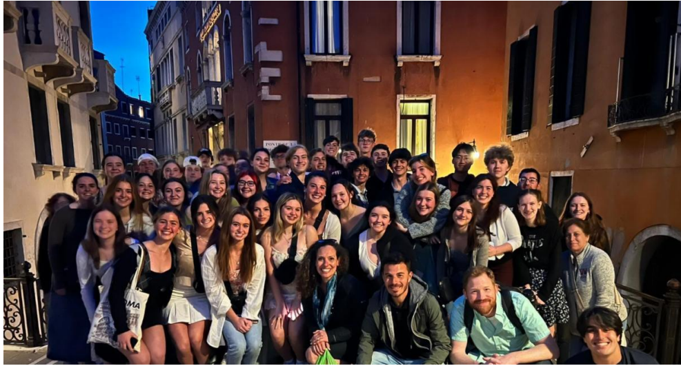
WHS Italian Students were lucky enough to spend their last night in Italy on the floating city of Venice!