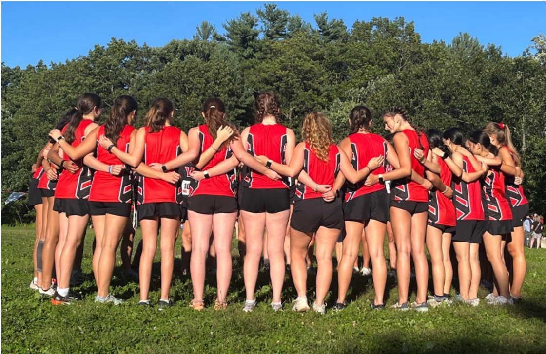
Girls XC Team at Reading Meet