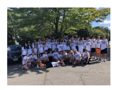
Boys and Girls Cross Country team volunteering at the Glen Doherty Race!

Tuesday's season opener against Wakefield was a battle but it was Winchester Girls for the win 20-39. In Saturday's Ocean invitational, Varsity Girls took 4th, JV girls took 1st, and JV Boys took 8th.