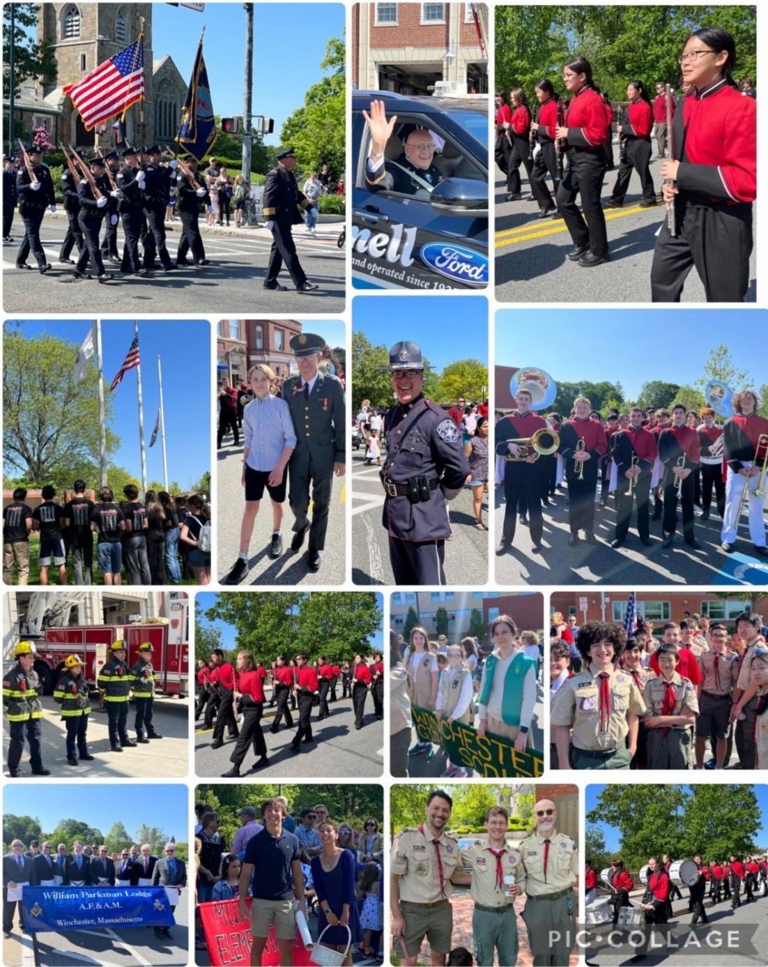
Every year our WHS community remembers and honors our Veterans on Memorial Day. Our WHS band, chorus, students, scouts and families pay tribute to those who have sacrificed their lives for our everyday freedom.