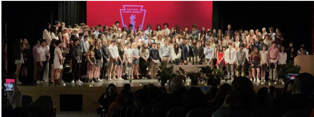
Thursday Night's National Honor Society Induction Ceremony