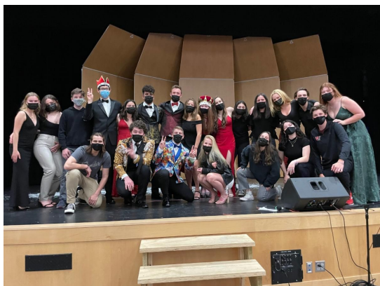
WHS Royals - Cast and Crew! WHAT A SHOW!