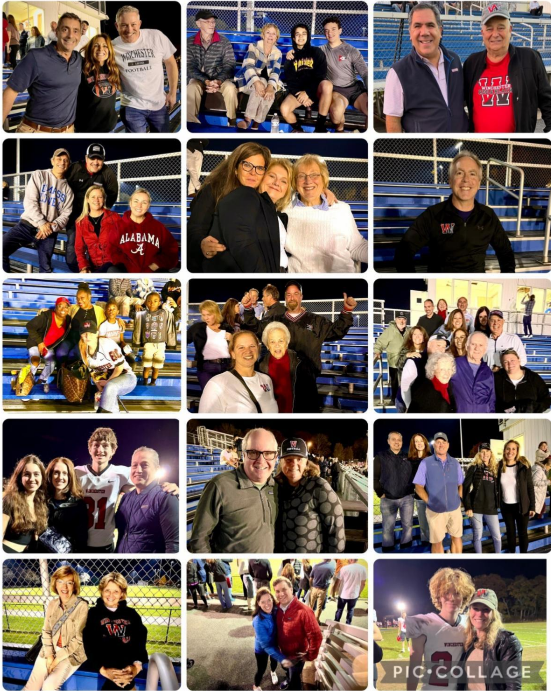
Another WHS Night with a fun theme- costumes!