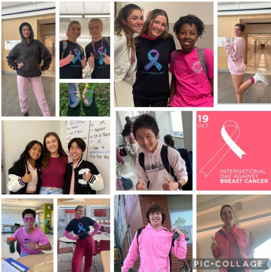
Last Wednesday, WHS students proudly wore pink for International Day Against Breast Cancer!