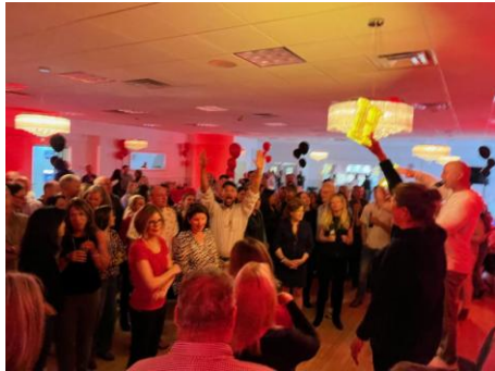
The Senior Fundraiser on Friday night was a sold-out success! Musical Bingo + parents = hysterical