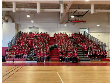
WHS Seniors Sporting their Red & Black Spirit last Wednesday.