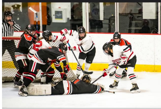
~Girls JV Ice Hockey~