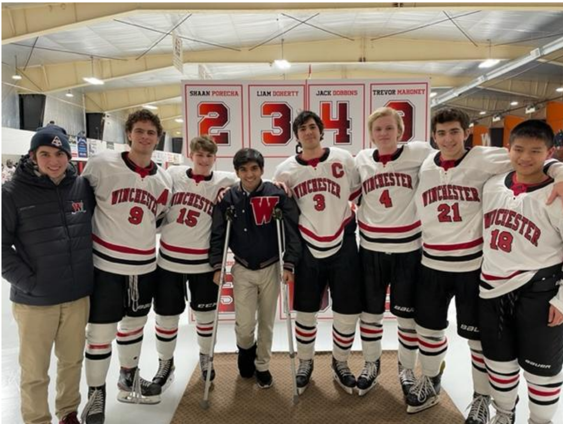
Boys JV Hockey Team