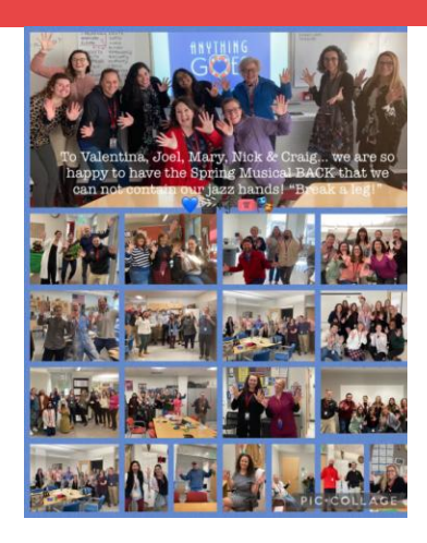
WHS Staff Sending fellow staff members "jazz hands" luck for the upcoming show!