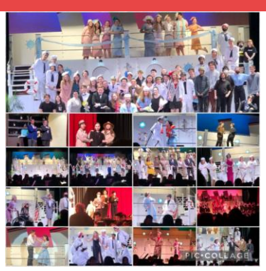
Student actors, artists, orchestra, lighting and tech crew all coming together to put on this AMAZING production of "Anything Goes!"