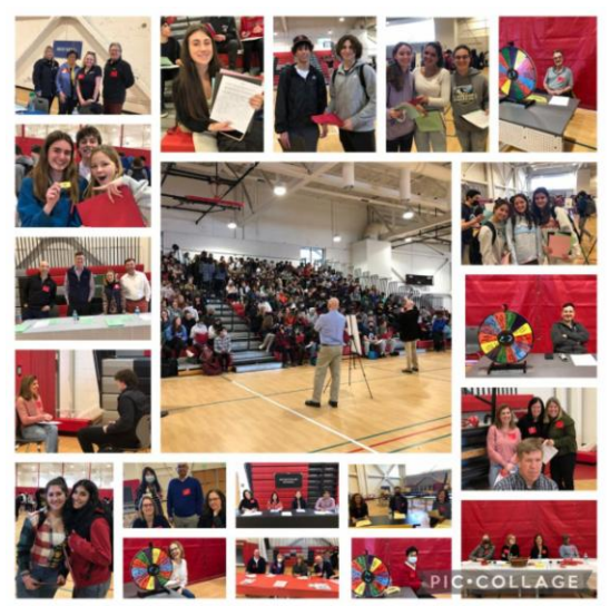
Financial Literacy for our Juniors-- so many parents came out to volunteer and teach our children the cost of everyday living! Find out how our Masked Staffer this week is connected with this cool life skill experience!