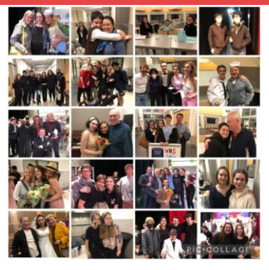
Behind the scenes we had so many helpers! We also had so many supportive and proud friends and families!